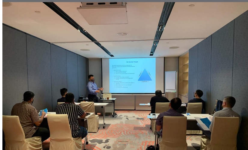
Trainer, Melvin Cheng, with participants in training room